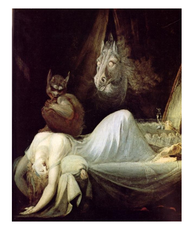
Henry Fuseli (Johann Heinrich Füssli), The Nightmare, 1781, Goethe Museum, Frankfurt