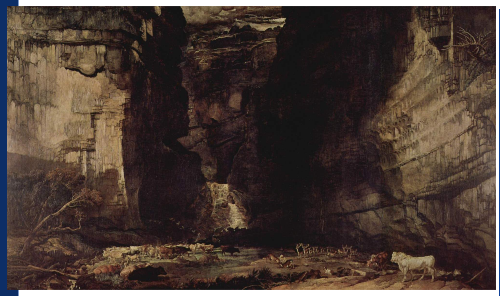
James Ward, Gordale Scar , 1814, London, Tate Gallery